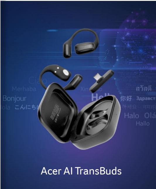
Acer AI TransBuds