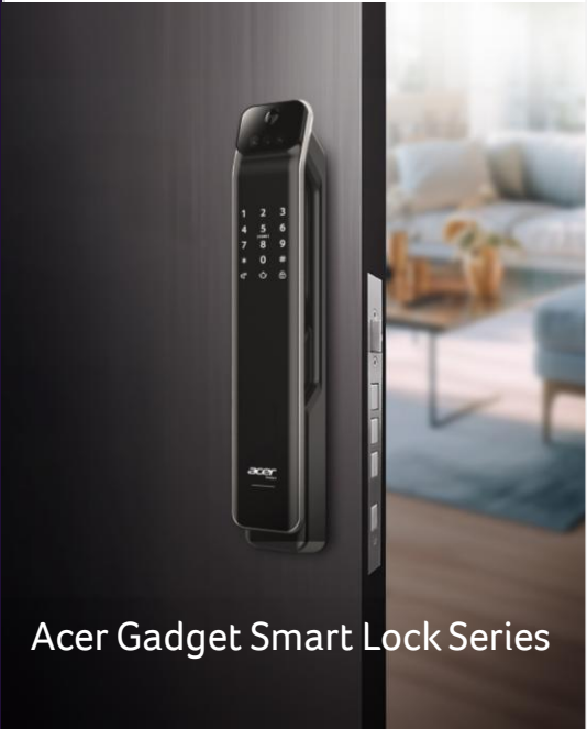
Acer Gadget Smart Lock Series