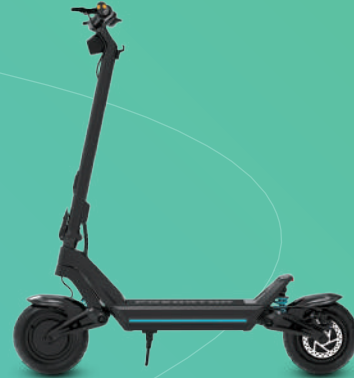
Predator eScooter Series