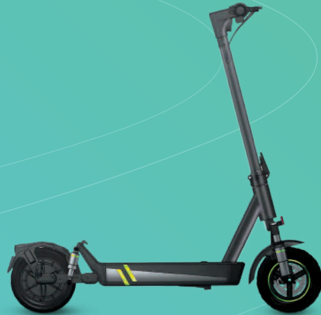
Acer eScooter Series